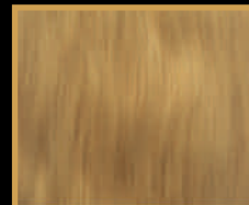
15 Golden Cream