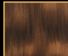
20 Autumn Gold