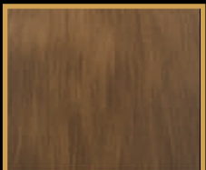
12 Smooth Oak