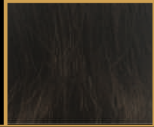
04 Hot Chocolate