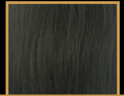
01 Silk Velvet

With a range of 26 stunning colours unique to our brand, Gold Class hair is the finest designer-label hair extensions that are ethically sourced and hand-picked to give you the very best in quality and the perfect colour match.