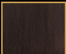
23 Moroccan Red