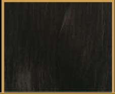
02 Black Coffee