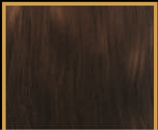
07 Rich Truffle