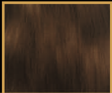
08 Glazed Gold