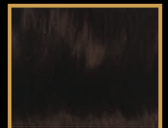
26 Mystic Red

Please note colours shown are for illustration purposes only.