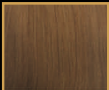
13 London Gold