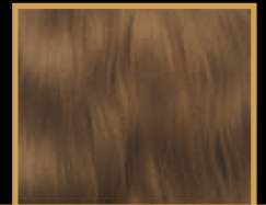
11 Iced Mocha