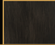
05 Golden Brown