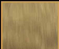
18 Iced Pearl