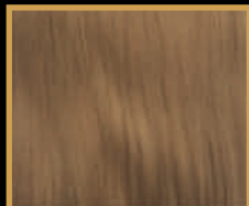
14 Vanilla Gold